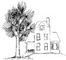
Trees that have been topped may become hazardous and are unsightly.