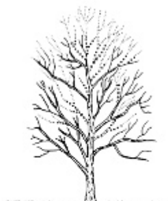
If the height of a tree must be reduced, all cuts should be made to strong laterals or to the parent limb. Do not cut limbs back to stubs.

This method of branch reduction helps to preserve the natural form of the tree. However, if large cuts are involved, the tree may not be able to close over and compartmentalize the wounds. Sometimes the best solution is to remove the tree and replace it with a species that is more appropriate for the site.