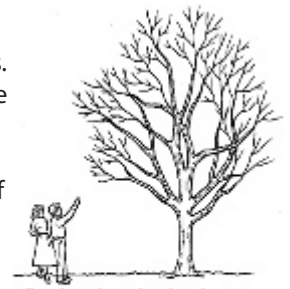
Professional arborists can determine what type of pruning is necessary to improve the health, appearance and safety of your trees.

Pruning large trees can be dangerous. If pruning involves working above the ground or using power equipment, it is best to hire a professional arborist. An arborist can determine the type of pruning that is necessary to improve the health, appearance, and safety of your trees. A professional arborist can provide the services of a trained crew, with all of the required safety equipment and liability insurance.